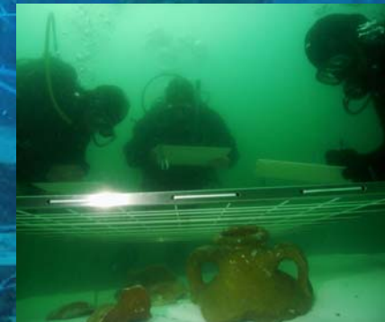
Training in focus.